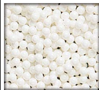
ZIRCONIUM OXIDE - 95% (Y2O3 STABILIZED) BALLS