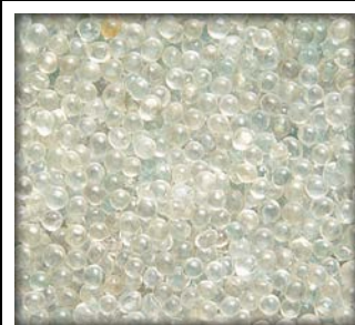
GLASS BEADS (LEAD FREE)