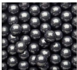
SILICON CARBIDE BALLS