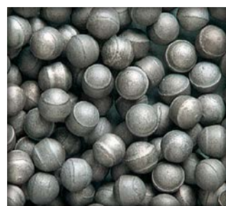
TUNGSTEN CARBIDE SATELLITES