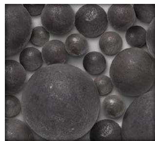
FORGED STEEL BALLS