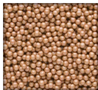
ZIRCONIUM OXIDE (CEO2 STABILIZED) BEADS