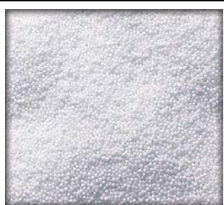
ZIRCONIUM OXIDE - 93% (Y2O3 STABILIZED) BEADS