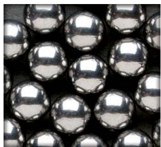
STAINLESS STEEL BALLS