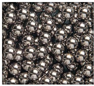
CARBON STEEL BALLS