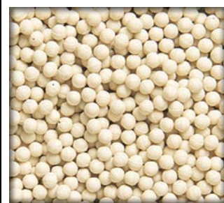
ZIRCONIUM SILICATE BEADS