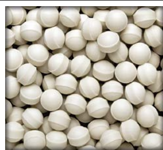
CERAMIC (STEATITE) SATELLITES